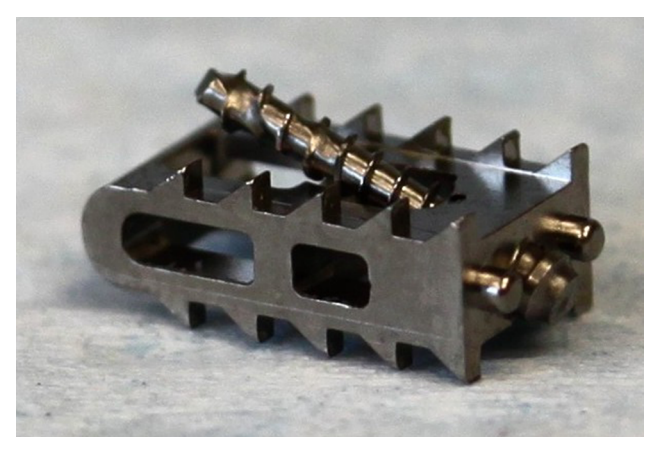
Figure 1 DTRAX® (Providence Medical Technology, Walnut Creek, CA, USA) cervical cage with bone screw.

Approval for this study was obtained from the Research and Development Committee of the Edward Hines Jr. VA Hospital for the use of human tissue. Six fresh-frozen human cadaveric cervical spine (C3–C7) specimens were obtained from a tissue bank accredited by the American Association of Tissue Banks (AATB). Radiographic screening was performed to exclude specimens with fractures, metastatic disease,